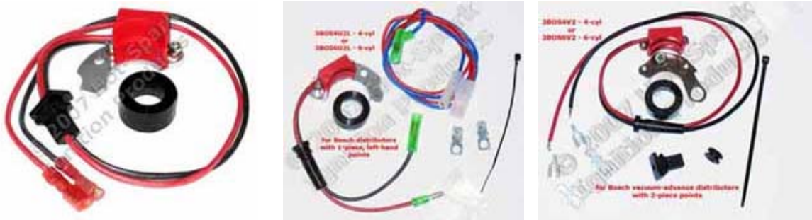
Left: 3BOS4U1 for 1-piece, right hand points, Center: 3BOS4U2L for 1-piece, left-hand points Right: 3BOS4V2 for vacuum-advance distributor with 2-piece, right-hand points

3BOS6U2L Universal ignition kit for 6-cylinder Bosch distributors with one-piece, left-hand points. Fits both vacuum-advance and centrifugal-advance-only distributors. Installation is similar to 3BOS4U1. After you remove the points, a 16mm box-end wrench should fit easily over the distributor shaft lobes. If the lobes are larger than that, you may need to order the 18.6mm I.D. magnet sleeve for Bosch 6-cylinder distributors (3BOS6U3L).