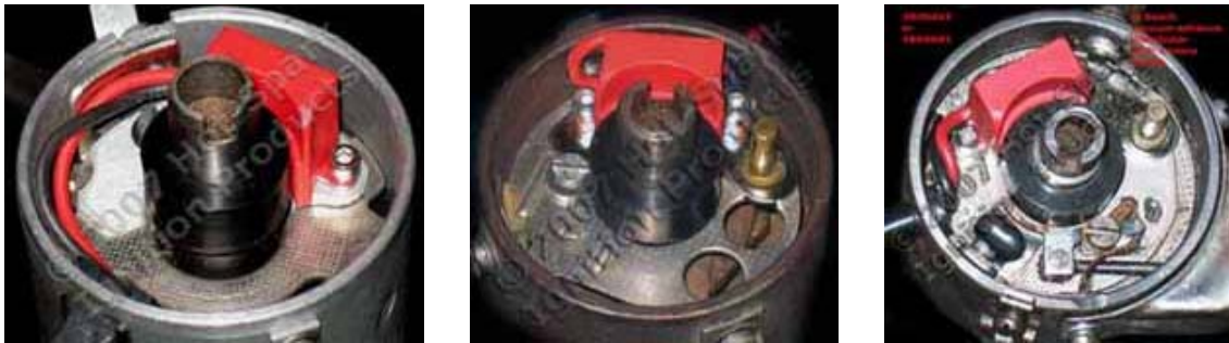
Left: 3BOS4U1 in distributor with 1-piece, right-hand points, Center: 3BOS4C2 in 010 non-vacuum distributor with 2-piece, right-hand points, Right: 3BOS4V2 in vacuum-advance distributor with 2-piece points

3BOS6U1: Universal ignition kit for 6-cylinder Bosch distributors with one-piece, right-hand points. Fits both vacuum-advance and centrifugal-advance-only distributors. Installation is similar to 3BOS4U1. After you remove the points, a 16mm box-end wrench should fit easily over the distributor shaft lobes. If the lobes are larger than that, you may need to order the 18.6mm I.D. magnet sleeve for Bosch 6-cylinder distributors (3BOS6U3).