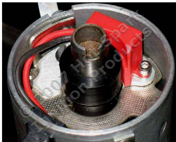
3BOS4UI for 4-cylinder Bosch Vacuum- or Centrifugal-advance Distributor

Ignition Timing: Set the ignition timing, with a stroboscopic light, to the distributor's factory specification. The difference in distributor position with points vs. electronic ignition can be as much as 30 degrees or so clockwise or counterclockwise, so you'll definitely have to reset the timing, using a stroboscopic timing light.